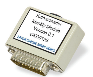
Figure 2 - KIM

Each sensor assembly is supplied with a Katharometer Identity Module (KIM) - see Figure 2. The KIM attaches to the analyser electronics and uniquely identifies the sensor and its calibration curves. This enables fast replacements to be made with no need for extended analyser downtime or lengthy calibration procedures.